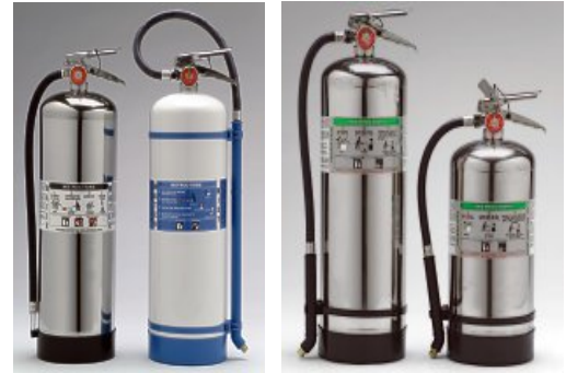
PW2½ & WM2½

This unit is designated for use wherever there is a Class A hazard near electrical equipment and the environment is of paramount concern. The extinguishing agent is de-ionized water, and the wand provides greatest operator safety. There is no risk of electrical conductivity or thermal or static shock. Ideal for use in health care, data processing, telecommunication, and clean room facilities. (Shipped empty)