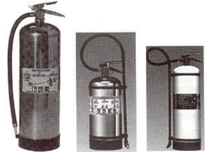
PW2½ WC-6L WM2½

This unit is designated for use wherever there is a Class A hazard near electrical equipment and the environment is of paramount concern. The extinguishing agent is de-ionized water, and the wand provides greatest operator safety. There is no risk of electrical conductivity or thermal or static shock. Ideal for use in health care, data processing, telecommunication, and clean room facilities. (Shipped empty)