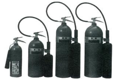
CD5 CD10 CD15 CD20